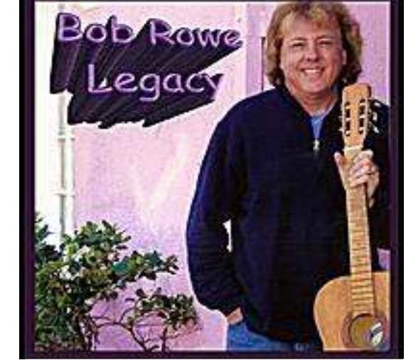
Cover from one of Rowe's twenty-one albums

https://en.wikipedia.org/wiki/Bob_Rowe#cite_notevisioncouncil.org-2 for more information.