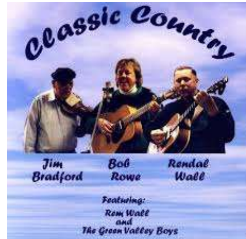
Album with the Green Valley Boys